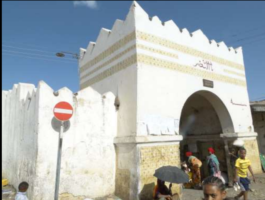
View of one of the doors of the city of Harar.