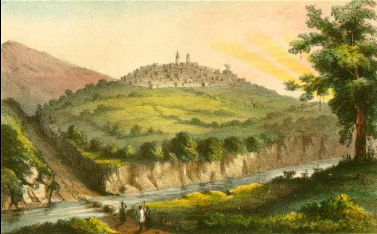
View of the city of Harar, from Sir R. F. Burton, First Footsteps in East Africa; or, An Exploration of Harar . London: Longman, Brown, Green and Longmans, 1856, pp. 291-92.