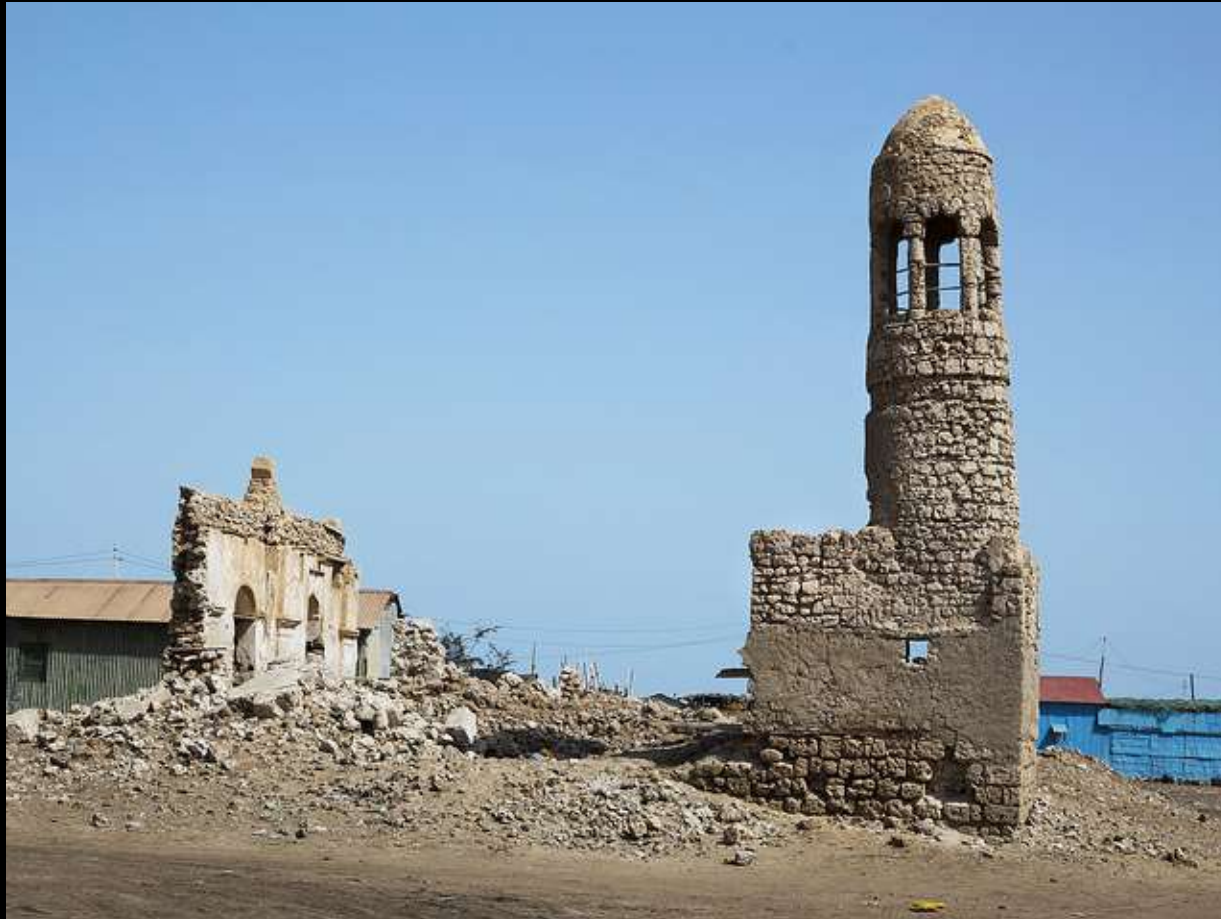
Relics of the Mosque of the Two Qiblas , Zaila, 7 o century CE.